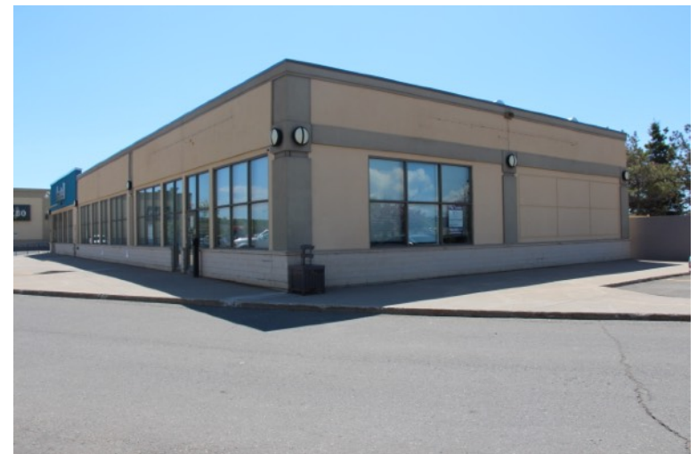
UNIT D6: 5,105 Square Feet