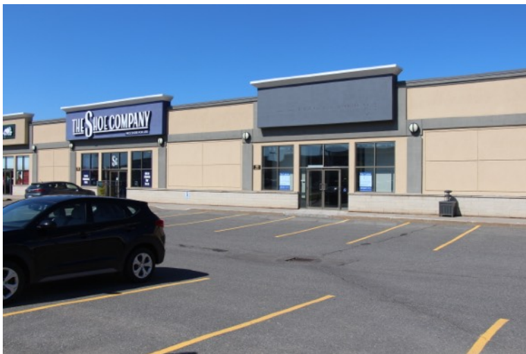
UNIT C3: 5,400 Square Feet