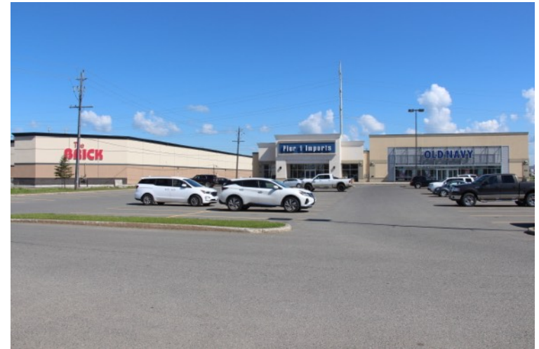
UNIT B2: 9,494 Square Feet