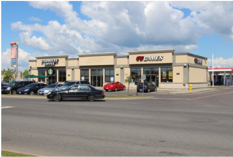
UNIT D10: 1,129 Square Feet